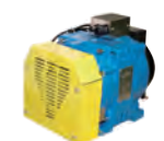
VL-H Series VL-H系列