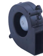
Ventilation Blower 换气鼓风机