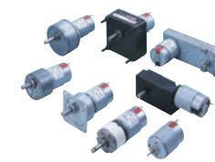
DC Motor for Drive Mechanism 驱动结构用的直流马达