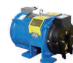
VL Series VL系列

With light and compact design, the machine and controller can easily fit small machine room, narrow hoistway and machine-room-less applications. 此类马达产品的设计轻便小巧，存放时能够节省空间。