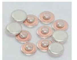
Rivet Contacts for electrical power distribution equipment switches (MALLOBOND) 配电开关复合铆接点