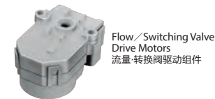
Flow / Switching Valve Drive Motors 流量转换阀驱动组件