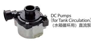
DC Pumps (for Tank Circulation) (水箱循环用) 直流泵