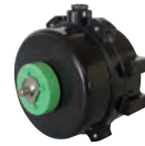
Sirocco Fan Motor 多翼片送风机马达