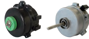
AC/DC Motors EC电机